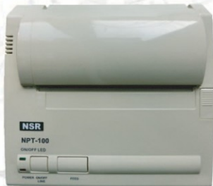
THERMAL PRINTER TERMINAL