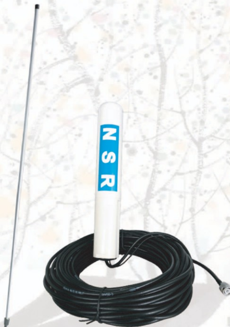
ANTENNA & AMPLIFIER

NAVTEX (Navigational Telex) is a world wide coastal telex broadcasting system. The broadcast stations transmit Navigational Warnings, Meteorological Warnings, Search and Rescue (SAR) information and other types of information. The NVX-1000 receives NAVTEX messages and displays them together with station ID. Every incoming message is read on the LCD display; No paper is required. Also, the NVX-1000 supports reception of all three IMO NAVTEX frequencies and provides simultaneous dual channel monitoring of two channels. The channel of 518kHz is always active, while either that of 490kHz or that of 4209.5kHz is active as selected in advance. NVX-1000 conforms to the latest rules including IMO MSC.148 (77) and IEC 61097-6.